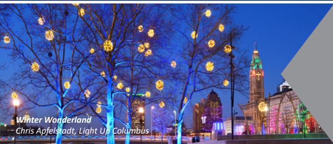
Winter Wonderland Chris Apfelstadt, Light Up Columbus