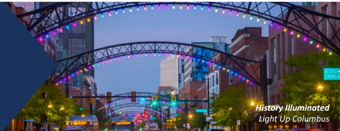
History Illuminated Light Up Columbus

Lighting installation designed to enhance the overall landscape and architecture of the commercial property.