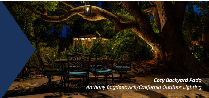
Cozy Backyard Patio Anthony Bogdanovich/California Outdoor Lighting

Lighting installation in any area in the built environment where people entertain or “live” outside, such as a patio, deck, covered terrace, outdoor kitchen, fireplace (or fire pit) area or dining area (spaces that are not part of the general planted landscape).